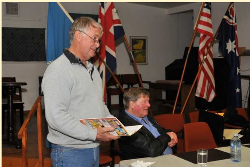
The "Acting Sarg."